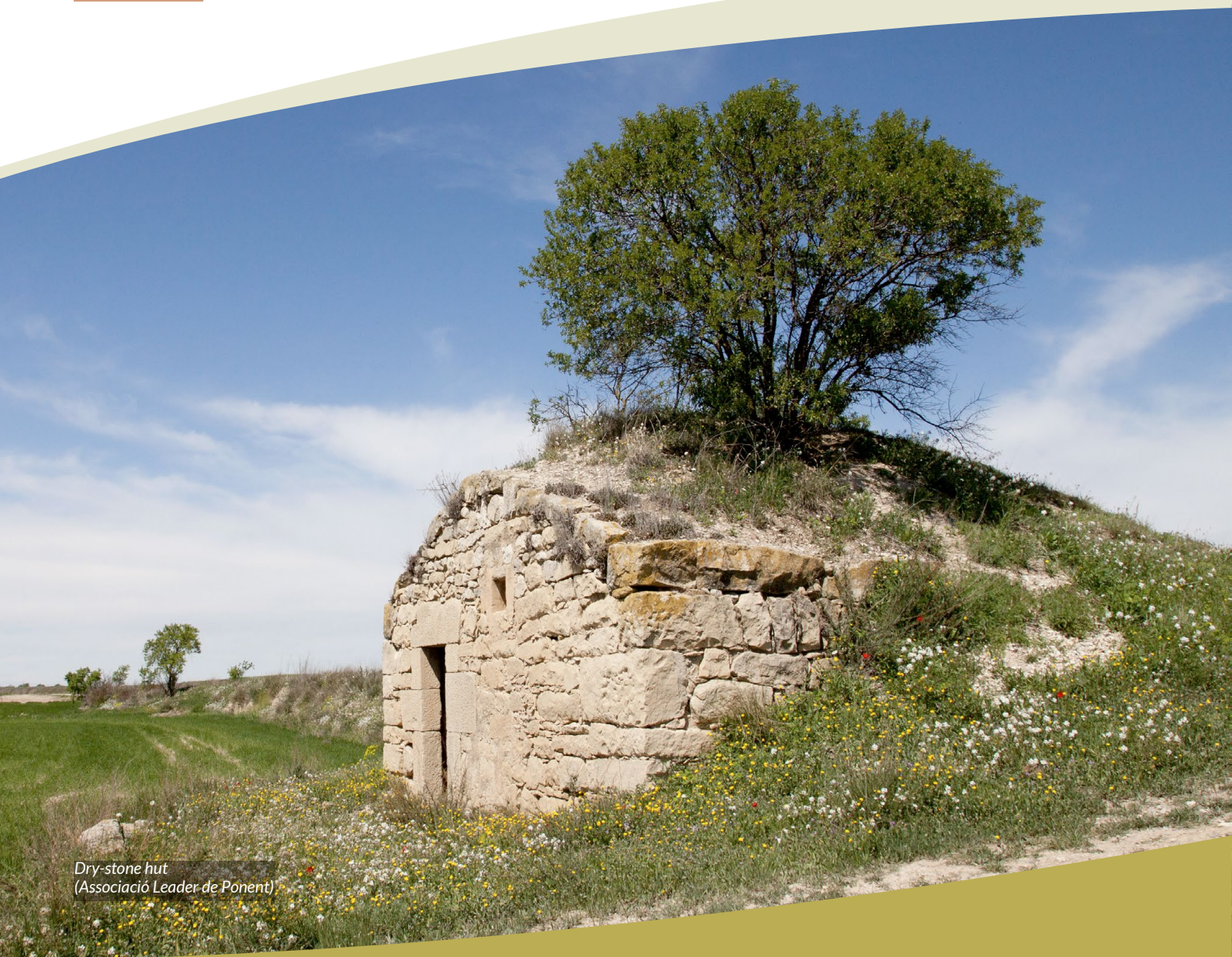
Dry-stone hut