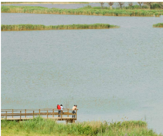
Ivars i Vila-sana lake (Consortium Estany d'Ivars i Vila-sana)