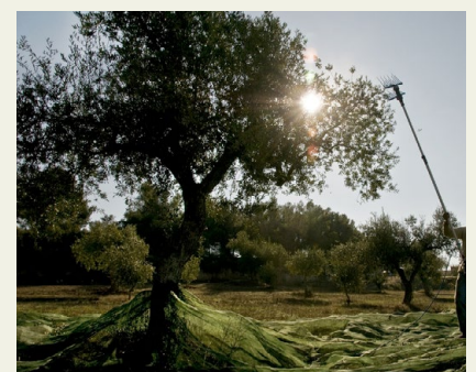
Manual harvest of olives for extra virgin olive oil (Consorci Garrigues pel Desenvolupament del Territori)